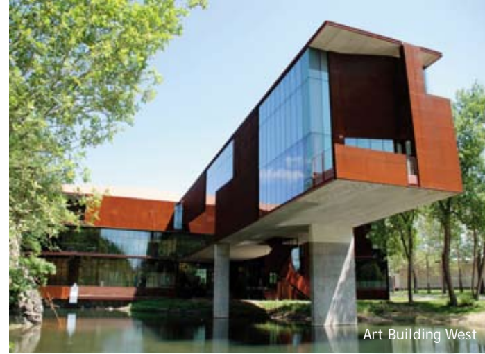
Art Building West