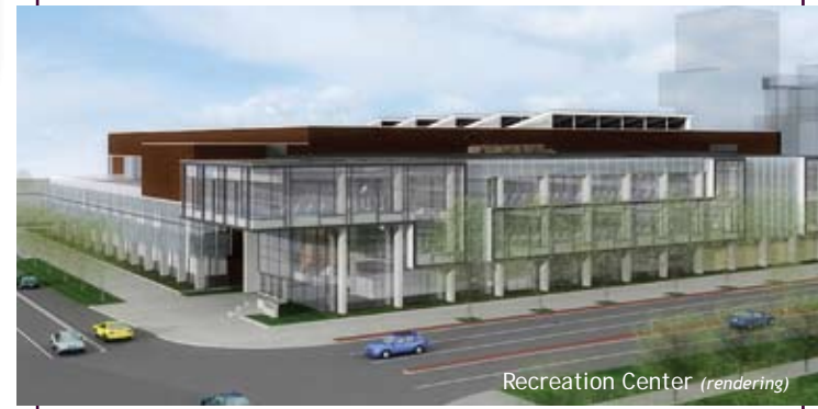
Recreation Center (rendering)