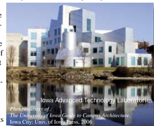
Iowa Advanced Technology Laboratories

Home to the Old Capitol, the East Campus represents the origin and symbolic core of the University of Iowa. The limestone architecture of the Pentacrest turns toward brick as buildings move farther away. The College of Liberal Arts & Sciences, Tippie College of Business, and Engineering, occupy many of the structures in this “undergraduate” section of the campus. The East Campus flows to the Iowa River valley, 70 feet below the stately Pentacrest. Where the valley and river meet, stands the Iowa Advanced Technology Laboratories, one of the most-recognized buildings on campus.