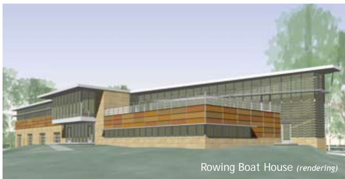
Rowing Boat House (rendering)