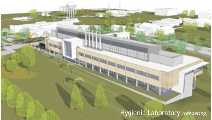
Hygienic Laboratory (rendering)